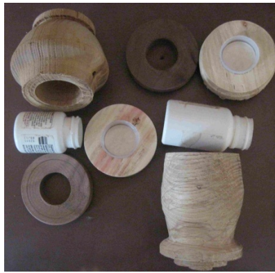
Bernie – 2 sets of pill box parts in process