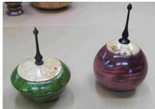
Jim Silva – two dyed Maple Burl boxes using water soluble dyes from a Woodworkers Supply sample pack