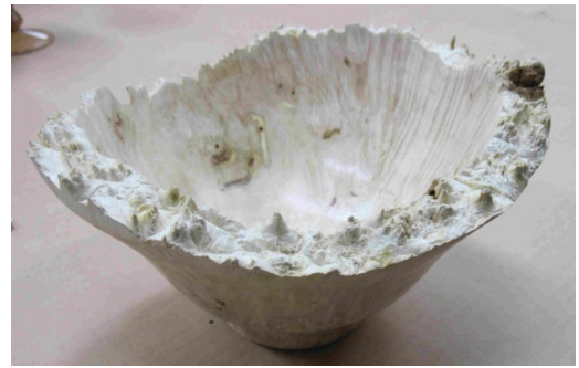
Phil Arcouette – showed an assortment of turnings including a Cherry burl bowl, curly maple box w/buckeye finial, Oak bowl, Bowl of California olive wood, and some boxes from pallet wood