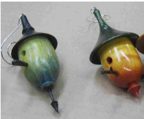
Jim Leatherwood – two alcohol based dyed bird house ornaments

(2)- embellish a turning. The embellished piece must have part, or all of it, colored in some way, turned from any wood and - you can stain it, burn it, paint it, dye it, inlay it, ebonize it, shoe polish it, gold leaf it, ????