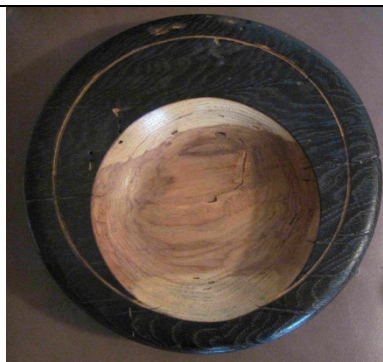
Bernie – burnt Oak platter