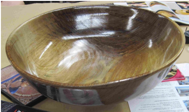
Bill Dooley – Walnut bowl – a large chunk flew off, was found a few days later, and reglued in place