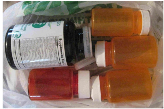
Some pill box raw material

(2)- embellish a turning. The embellished piece must have part, or all of it, colored in some way, turned from any wood and - you can stain it, burn it, paint it, dye it, inlay it, ebonize it, shoe polish it, gold leaf it, ????