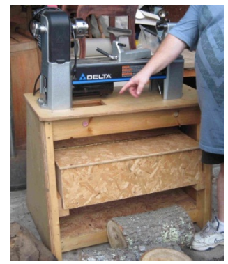
Jim Silva donated a sturdy lathe stand