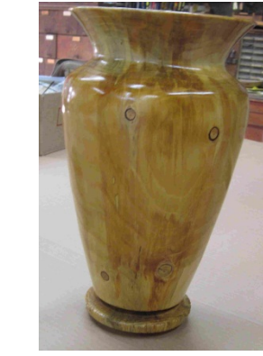
Ian Manley showed several items "stool sample" in Bloodwood, Thula Burl vessel, and an 8" Pine bowl. The Pine vessel is from a 40 year old tree that a friend planted when in high school. The tree was felled in a storm and has been sitting waiting to be turned for 18 months.