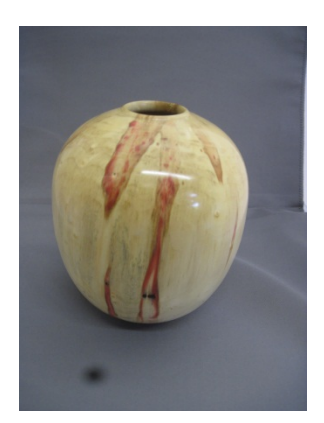
Jim Leatherwood showed a Box elder hollow form