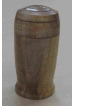
Emillio Iannuccillio : a toothpick dispenser in Maple {size of dispensing hole seems to be critical with a screw top and a personal toothpick holder