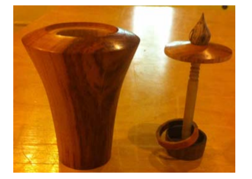
Bob Scott : Cherry pop up toothpick holder has a spalted Oak top and a Walnut sapwood internal post -