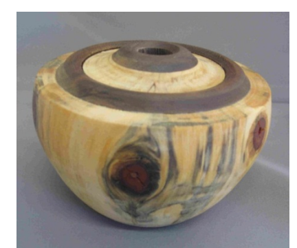
Bernie NIP hollowform with Walnut rings won by Jim Leatherwood