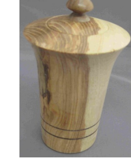
Jim Leatherwood -Ash