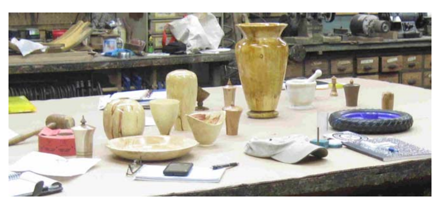
Some of the Show & Tell items