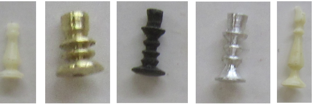
Lenny showed a series of miniature candlesticks turned out of Bone, brass, aluminum, and bone