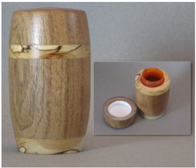
basic pill box