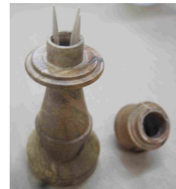
Jeff Keller - pop up Walnut toothpick holder and a personal chess toothpick holder in Walnut w/Olive wood